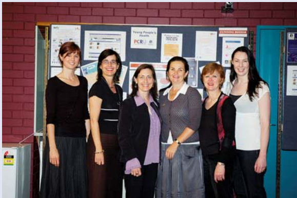
PCRU Young People's Health Research Team