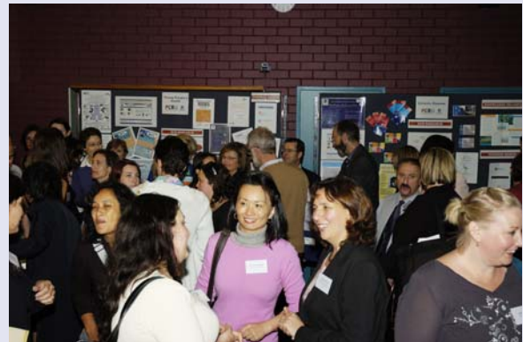
PCRU Launch Attendees