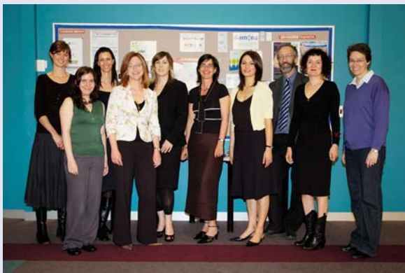
PCRU Mental Health Research Team