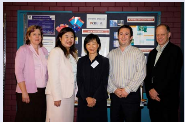
PCRU Chronic Disease Research Team